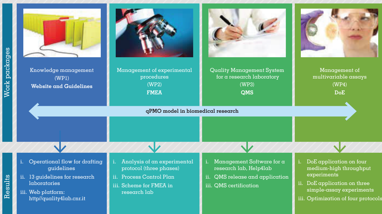
Fig 1. The qPMO Model in biomedical research and the results of each

Basic principles of QPM were carefully analysed and discussed with all the participants, before being interpreted and translated into a language familiar to scientific researchers. This activity enabled participants to exploit the approaches of quality management in the organisation of their research laboratories. Overall, the 4 WPs contributed to the creation of a 'concept laboratory', which is referred to as the qPMO Model, that entails the successful implementation of procedures able to save money, time and intellectual resources to be invested in research creativity. The results of the three-year project are summarised in Figure 1.